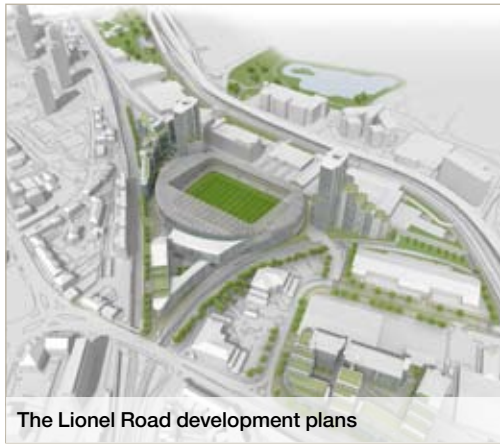
The Lionel Road development plans

such as Gunnersbury Mansion and Boston Manor House, and is currently considering how best to regenerate those assets in keeping with their status and surroundings.