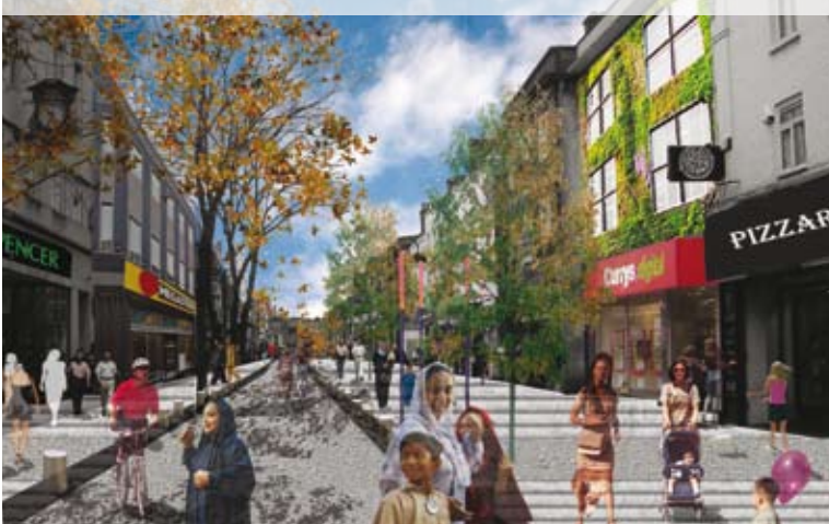
The vision for Hounslow Town Centre

The strategy is focussed on seven major sites ready for development. One has been known as Blenheim Centre Phase two, although it is unlikely to feel like a phase two of the mixed use scheme completed in 2006. That development received a mixed response, mainly because of its